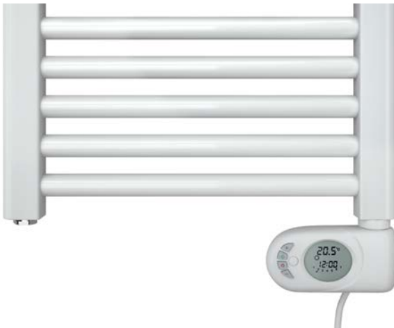
Electric operation version with integrated immersion heater Musa Eco