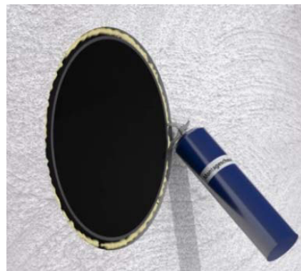
Fig. 5 Sealing the wall mounting pipe

Using suitable sealant, seal the inside and outside of the wall connection around the PVC wall mounting pipe (Fig. 5). After installation, reinsert the blanking plugs at both ends of the PVC wall mounting pipe.