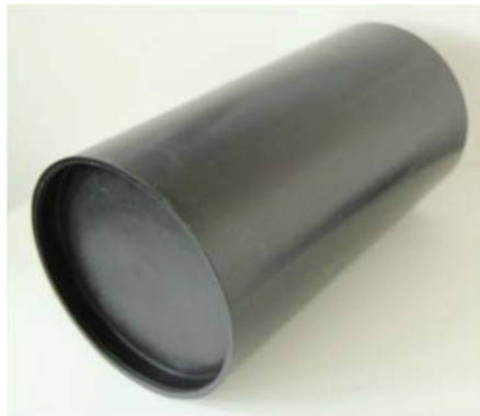
Fig. 1 Scope of delivery for round wall mounting pipe

The round wall mounting pipe with an external diameter of 315 mm is made of PVC and is supplied with two blanking plugs (Fig. 1). It is used to hold the ComfoSpot 50 ventilation unit. A core hole measuring \varnothing 340 mm must be drilled in the external wall for installation purposes. The final wall thickness must be between a minimum of 335 mm and a maximum of 885 mm.