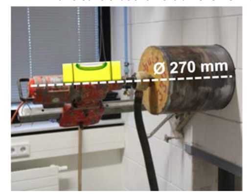
Fig. 2 Drilling the core hole

The hole diameter must be at least 270 mm. Make sure that the hole axis is horizontal (Fig. 2).