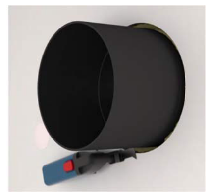
Fig. 4 Modifying the wall mounting pipe to make it flush Using suitable sealant, seal the inside and outside of the wall connection around the PVC wall mounting pipe (Fig. 5). After installation, reinsert the blanking plugs at both ends of the PVC wall mounting pipe.

Before installing the ventilation unit, modify the PVC wall mounting pipe so that the end of it is flush with the surface of the façade or interior wall (Fig. 4). To do this, trim the pipe using a suitable tool until the end of it is flush with the finished wall.