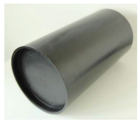
Fig. 1 Scope of delivery for round wall mounting pipe

The round wall mounting pipe with an external diameter of 250 mm is made of PVC and is supplied with two blanking plugs (Fig. 1). It is used to hold the ComfoAir 70 ventilation unit. A core hole measuring \emptyset 270 mm must be drilled in the external wall for installation purposes. The final wall thickness must be between a minimum of 275 mm and a maximum of 900 mm.